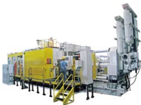
The Group's 3000-tonne large tonnage cold chamber die-casting machine supplied to a renowned customer in the USA

As a result of the financial crisis, new orders for large die-casting machines were sluggish, and the delivery of existing orders were postponed, only small die-casting machines gained a growth in the unfavourable environment during the first half of the year. However, during the second half of the year, delivery of the postponed orders resumed gradually, and new orders also increased rapidly. The growth momentum in the die-casting machine market in the PRC, in particular, was encouraging. The turnover of the Group's die-casting machines products from the PRC market for the year increased by more than 65% over last year.