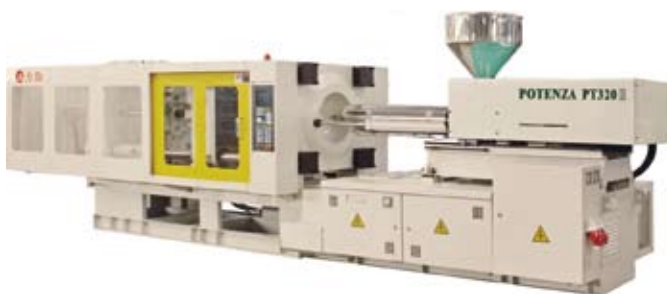
The Group’s 320-tonne servo-driven energy-saving plastic injection moulding machine

During the year, the Group made good achievement in the R&D of plastic injection moulding machines. In respect of servo-driven energy-saving plastic injection moulding machines, after authoritative inspection and testing by the Chinese National Plastic Machinery Products Quality Supervision and Inspection Centre, the servo-driven energy-saving high precision plastic injection moulding machines developed by the Group attained Grade 1 in the energy efficiency standard set out by the State, and gained a leading position among counterparts in the industry. On the basis of the “EFFORT” series of direct-clamp plastic injection moulding machines which were successfully launched, the Group has already developed the advance-performance second generation direct-clamp plastic injection moulding machines and is launching them in the market. In respect of large-scaled plastic injection moulding machines, the Group successfully developed the “FORZA” new series of large tonnage two-platen plastic injection moulding machines, and have also developed large tonnage plastic injection moulding machines with a clamping force of 3000 tonnes. This was not only an important breakthrough in the R&D of the Group, but also played a key role in expanding the scope of plastic injection moulding machines product profile, in meeting customer demands and in accelerating the development of the Group’s plastic injection moulding machine business.