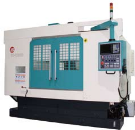
The Group's TC1200CNC machine

The Group's die-casting machines, plastic injection moulding machines and CNC machines all required a large volume of high-quality cast components. The Group's large-scaled modernised casting factory located in Fuxin City, Liaoning Province, has successfully developed a few hundred kinds of high-quality cast components, to be supplied to both the Group and the external customers.